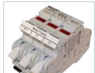
Continuous marking strip and adaptors