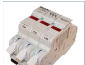
WMB Marker System