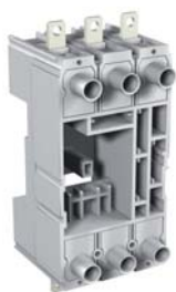
Fixed part of plug-in