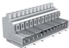
Socket-plug connector of fixed part