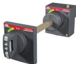
Extended rotary handle