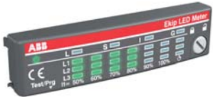
Ekip LED Meter