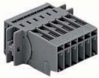
Socket-plug panel connector