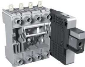
Fixed part of withdrawable