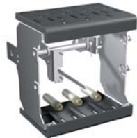
Conversion kit for turning a fixed circuit breaker into the moving part of a withdrawable circuit breaker