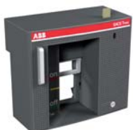
Front for operating lever mechanism