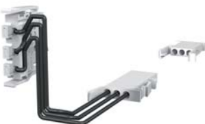
AUX for withdrawable