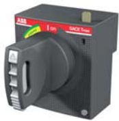
Direct rotary handle