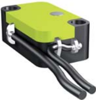
AUE - Early auxiliary contacts