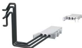
Fixed/Moving part connector for withdrawable

(2) Un-numbered cables. Withdrawable versions are IEC rated only.