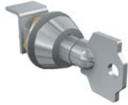
Key lock on the circuit breaker