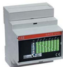
Time delay device for undervoltage release