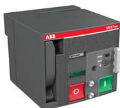
MOE - Motor operator