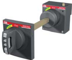
Extended rotary handle