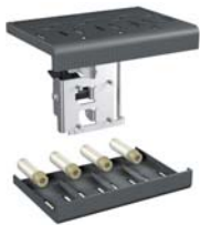
Conversion kit for turning a fixed circuit breaker into the moving part of a plug-in circuit breaker