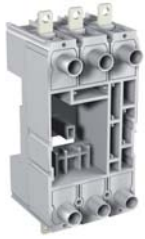
Fixed part of plug-in