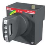
Direct rotary handle