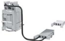
SOR for withdrawable