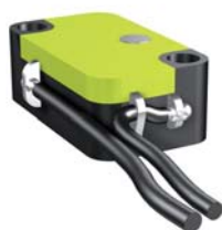
AUE - Early auxiliary contacts