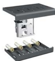
Conversion kit for turning a fixed circuit breaker into the moving part of a plug-in circuit breaker