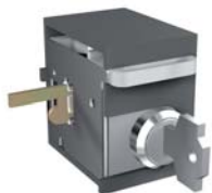
Ronis key lock/padlock for fixed part